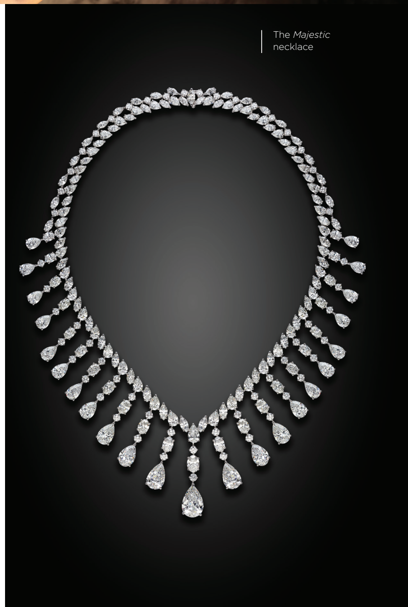
The Majestic necklace

DEHRES IS A CONNOISSEUR'S INSIDER FAVOURITE FOR ITS SEDUCTIVE DESIGNS AND RARE, HIGH-QUALITY GEMSTONES