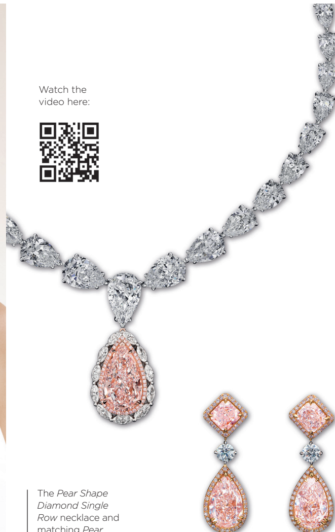
The Pear Shape Diamond Single Row necklace and matching Pear Shape Pink Diamond earrings